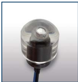
FR 20 ATEX version